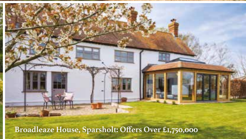
Broadleaze House, Sparsholt: Offers Over £1,750,000