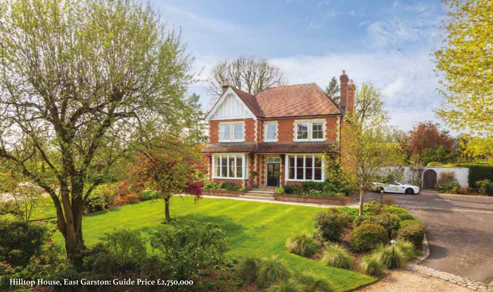
Hilltop House, East Garston: Guide Price £2,750,000