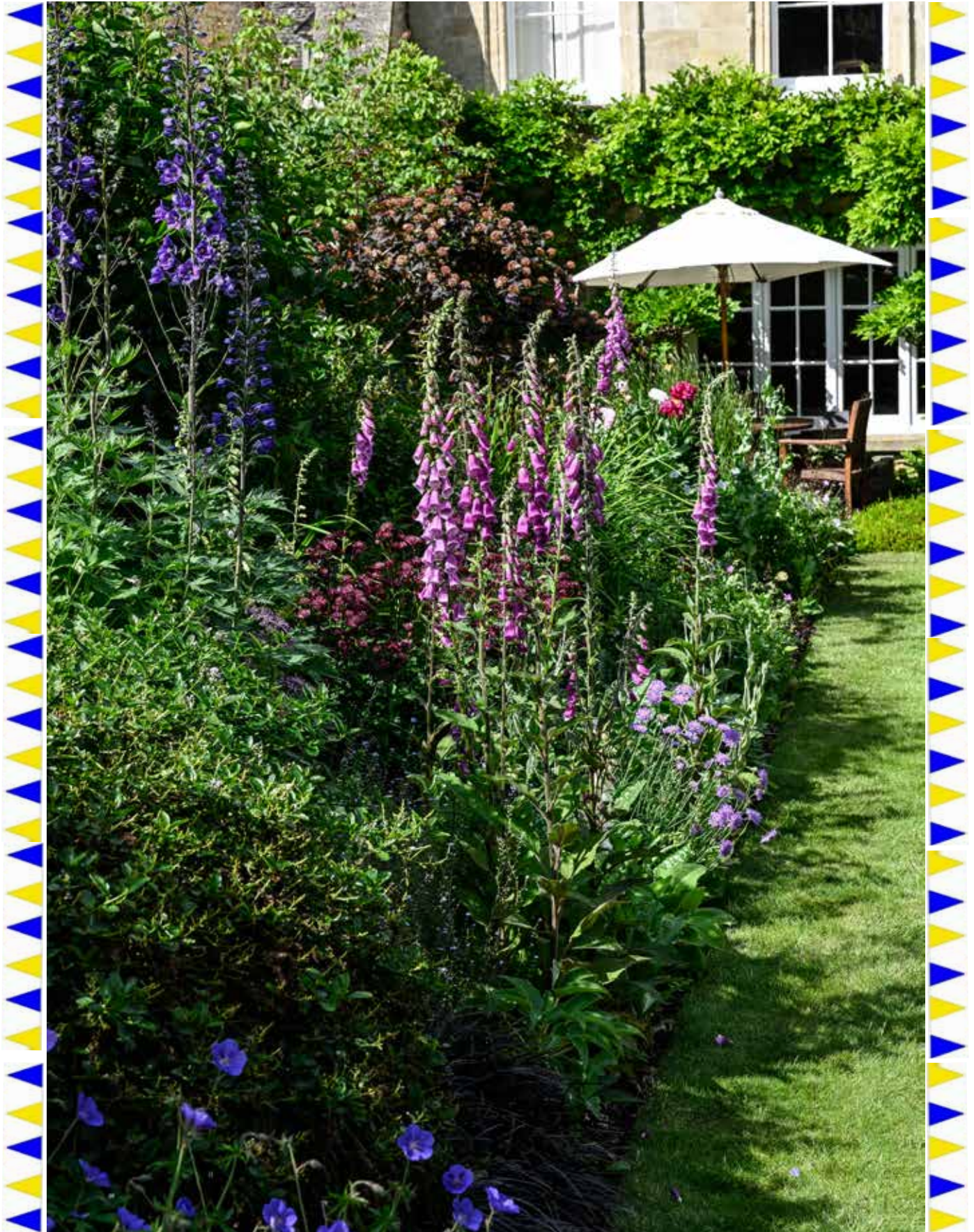
A photo of one of many beautiful gardens on display during the Burford Festival

A monthly magazine covering people and events in our area of the Cotswolds, and delivered to Aldsworth, Asthall, Asthall Leigh, the Barringtons, Bradwell Village, Burford, Field Assarts, Fordwells, Fulbrook, Holwell,, Sherborne, Shilton, Signet, Swinbrook, Taynton, Upton, Westwell, Widford, Windrush. Volume 13, Number 6, £1.50