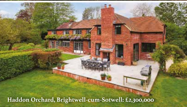
Haddon Orchard, Brightwell-cum-Sotwell: £2,300,000