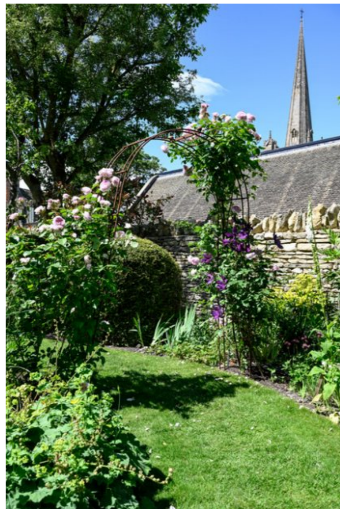
Image of a Burford Garden with the Church behind and another picture of the Church about to be buntinged!