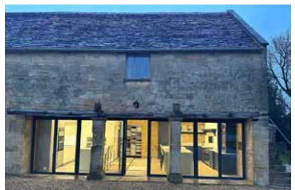
Pinchpool Farm, Windrush, Burford, OX18 4TT